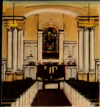
West End Baptist Church, W. Washington at St. James Ave., Suffolk, Va.